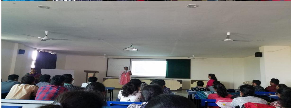
Students expressing their views about the topics