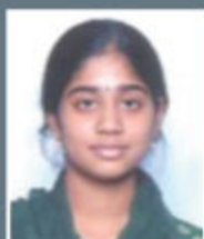
STG SREEVIDYA CSE SAP - 8.5 Lakhs HITACHI - 4.25 Lakhs CSC - 3.3 Lakhs