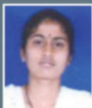
CH. BHAVANI CSE HP 3.6 Lakhs