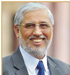
Anil D Sahasrabudhe Chairman, AICTE

I am very happy to see that the detailed guidelines have been issued by Ministry of Human Resource Development on National Innovation and Startup Policy for students and faculties of higher education institutions which further strengthens the Startup Policy released by All India Council of Technical Education in November 2016 from Rashtrapati Bhawan, just after few months of Startup action plan announced by the Government of India in January 2016.