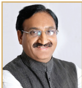
रमेश पोखरियाल 'निशंक' मानव संसाधन विकास मंत्री

स्टार्ट-अप इंडिया भारत सरकार की एक प्रमुख पहल है, जो नवीन आविष्कारों को हाथ में लेने, सहायता और प्रोत्साहनों के वित्त पोषण, उद्योग-शैक्षणिक भागीदारी और इन्क्यूबेटरों के बुनियादी स्तंभों पर आधारित है।