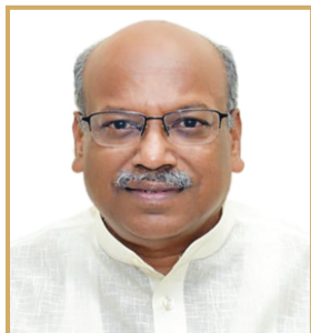
Sanjay Shamrao Dhotre Minister of State for Human Resource Development

India aspires to become a 5 trillion dollar economy in a near future. To reach this mark, it needs to evolve system and mechanisms to convert the present demographic dividend into high quality technical human resource, capable of doing cutting edge research and innovation, and deep-tech entrepreneurship. At this juncture, the MHRD's Innovation Cell and AICTE have brought out the 'National Innovation and Startup Policy 2019' for students and faculty.