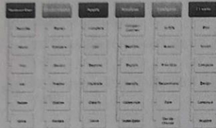
Bloom's Taxonomy.jpg 40K