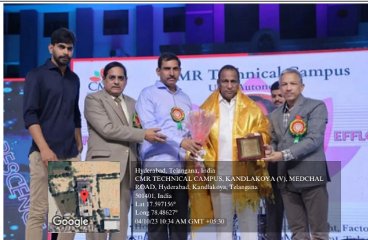
Photo 1: Inaugural Photo with Guest along with banner( Geo tagged)