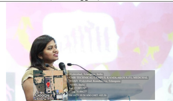
Photo 1: Inaugural Photo with Guest along with banner( Geo tagged)