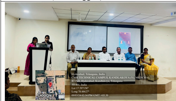
Photo 1: Inaugural Photo with Guest along with banner( Geo tagged)