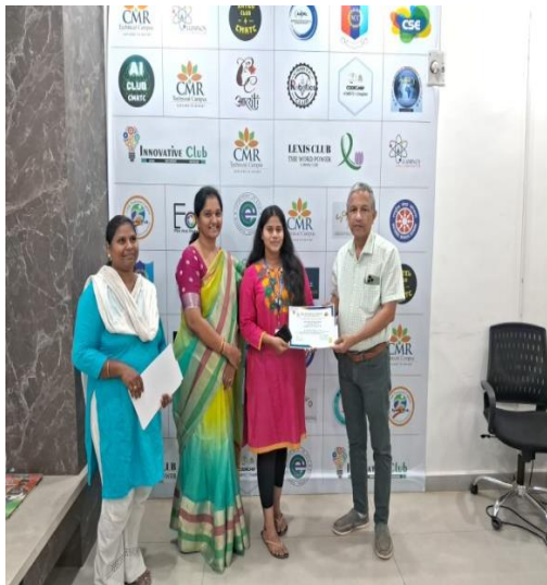
NATIONAL TECHNOLOGY DAY-1 ST PRIZE