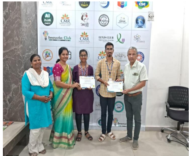
NATIONAL TECHNOLOGY DAY-2 ND PRIZE