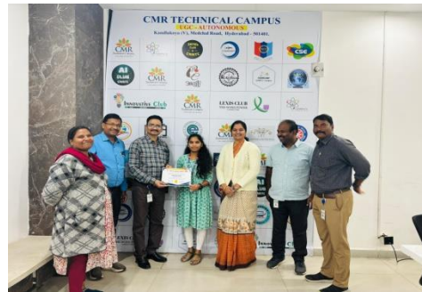
1 ST PRIZE