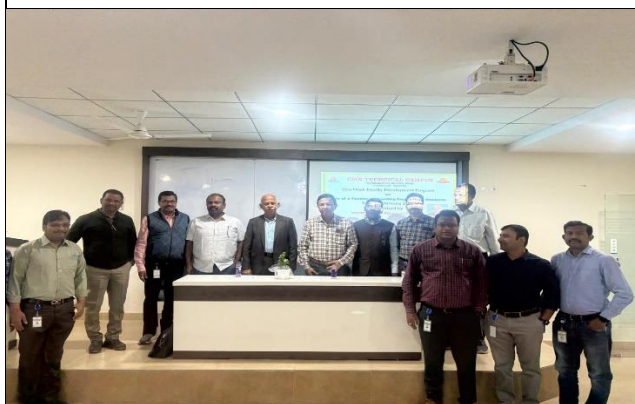
Photo 1: Inaugural Photo with Guest along with banner (Geo tagged)