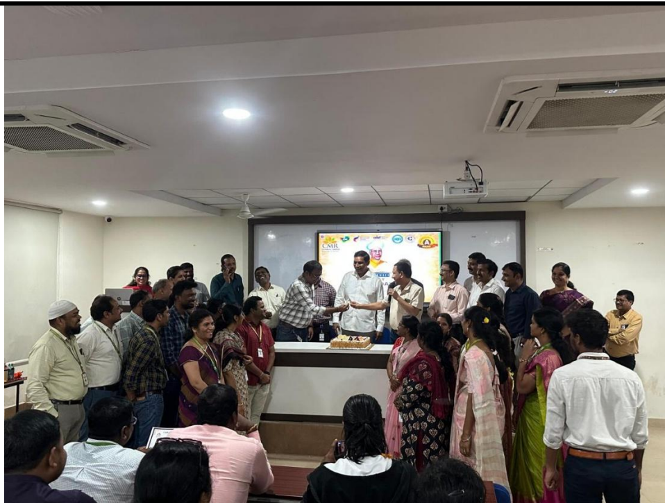
Event Photograph 3